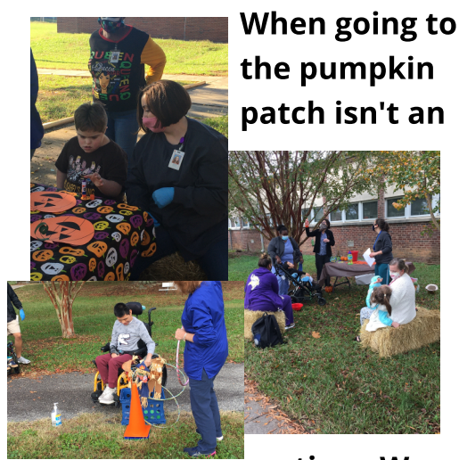
option. We bring the fun and festivities to